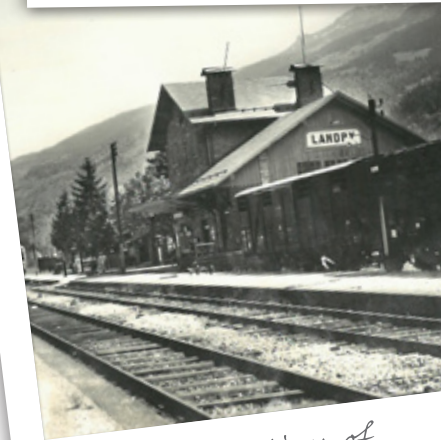
Train station of Landry in 1967