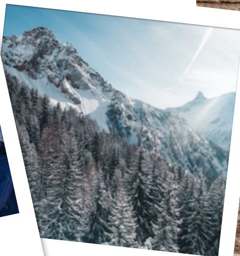
Aiguille Rousse and Aliet