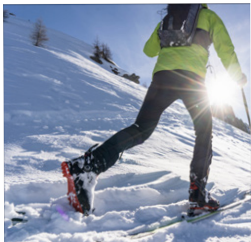
Movement ski test