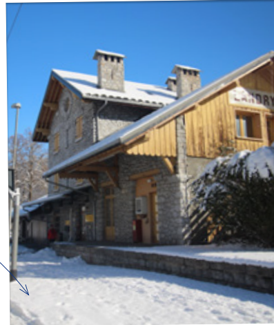
Train station of Landry in 2023

this option to winter holidaymakers. There are also shuttle services to the hamlets and resorts of Peisey-Vallandry. A vital green alternative for a sustainable future!