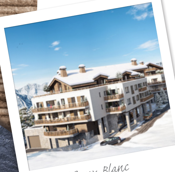
The Cristaux Blancs

La Cour aux Écureuils is a new establishment that carries on a long heritage of accommodation while looking to the future with a real breath of modernity. Situated at the foot of the Parchey chairlift, it offers ski-in/ski-out access to the slopes. 51 flats and a self-contained chalet await guests, with spacious accommodation and a style that blends mountain identity with modern codes. Accommodation includes Wi-Fi access and private parking, as well as access to a spa with an indoor swimming pool and a fitness room... ideal for après-ski just the way you like it.