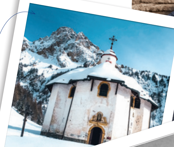
Notre-Dame des Vernettes

The little extra: Guided tours are offered throughout the year in collaboration with the FACIM Foundation. This way, the baroque culture becomes accessible to as many people as possible.