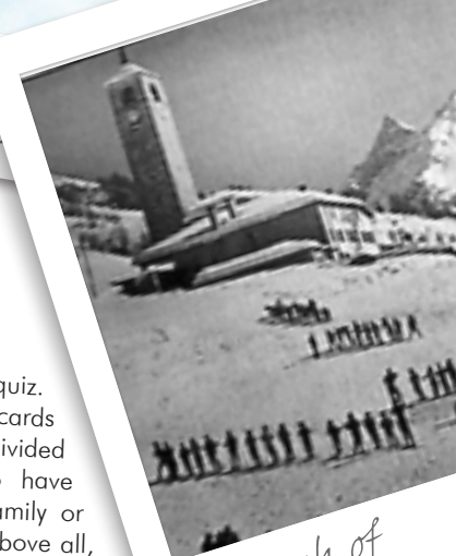
Church of Peisey

be found in this quiz. Altogether, 50 themed cards and 150 questions, divided into 5 categories, to have fun, challenge your family or friends but also, and above all, to learn more about the natural, cultural and patrimony heritage that makes this area so rich.