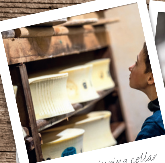
Cheese maturing cellar