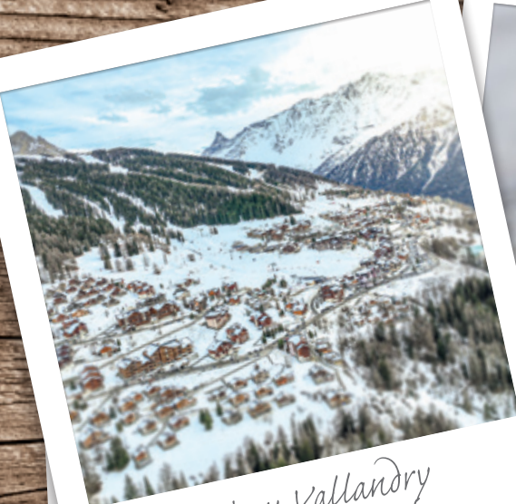
Peisey-Vallandry Green Resort