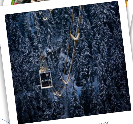
The Vanoise Express